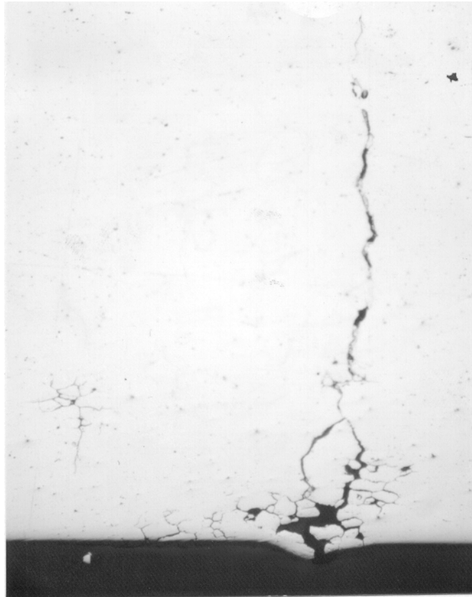
Figure 1 – HW Cylinders (AA 6061) Fatigue crack initiated from a corrosion pit. Magnification X 125