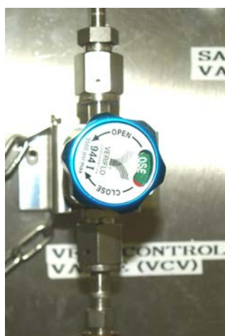
Figure 7 – Manual control valve

Rapid removal of the gas phase from a liquefied gas may cause the liquid to cool too rapidly, causing the pressure and flow to drop below the required level. In such cases, cylinders may be heated with temperature controlled to no higher than 125°F. Rapid gas removal can also be effected by transferring the liquid to a heat-exchanger, where the liquid is vaporized to a gas. This method imposes no temperature limitations on the material; however, care should be taken to prevent blockage of the gas line downstream of the heat-exchanger, as this may cause excessive pressure to build up in both the heat-exchanger and the cylinder. Safety relief devices should be installed in all liquid-transfer lines to relieve sudden, dangerous hydrostatic or vapour-pressure buildups.