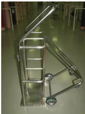
Figure 2 – Hand truck

Avoid dragging or sliding cylinders. Use hand trucks even for short distances.