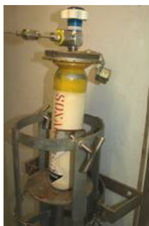
Figure 4 Small cylinder stand