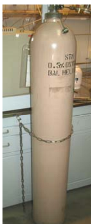
Figure 3 Cylinder holder

When the cylinder has reached its destination in the laboratory, it should be secured to a wall, a bench, or some other firm support, or placed in a cylinder stand or rack (Figures 3, 4 and 5). An ordinary chain or belt of the type commonly available from the gas supplier can be used. Once the cylinder has been secured, the cap may be removed, exposing the valve. The number of cylinders in a laboratory should be limited to minimize the fire and toxicity hazards.