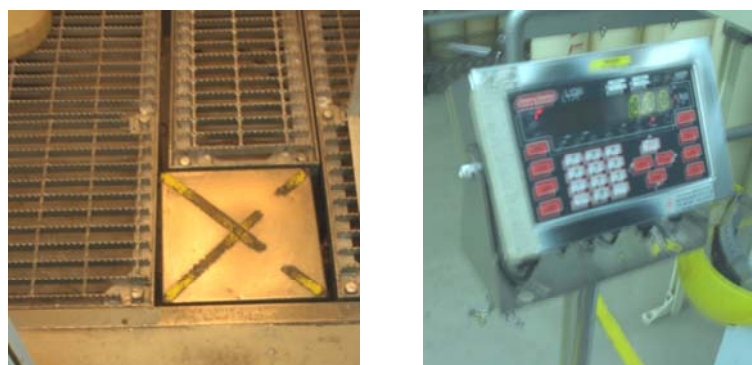
Figure 9 - Weigh scale platform and indicator

It is, therefore, impossible to determine the content of a cylinder containing a liquefied gas, except by weighing. A scale such as the one shown in Figure 9 makes this convenient. Cylinders containing liquefied gases are stamped or tagged with the tare weight in order to allow the content to be determined.