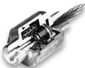
Flammable gas flash arrestor

Whenever a flammable gas is to be used it is recommended that a simple flash arrestor be installed in the line. Flashback is the reversing of the flame such that it travels through the line back into the pressure regulator or cylinder.