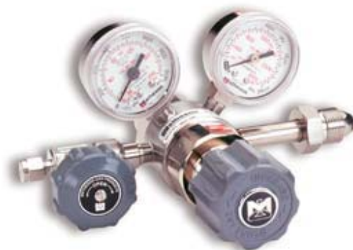
Figure 8 – Pressure regulator