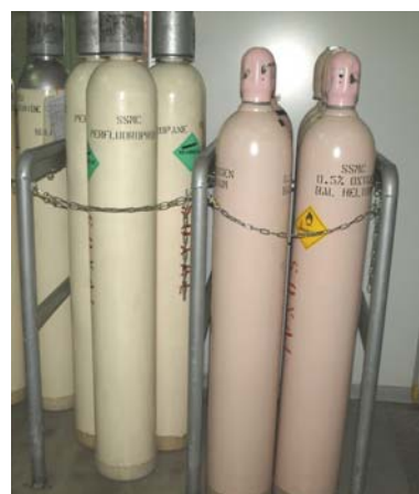
Figure 5 Rack cylinder storage