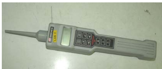
Figure 10 – Gas detector

There are numerous monitoring devices available for detection of dangerous concentrations of gases in the atmosphere (Figure 10). There are also appropriate chemical procedures for detecting leaks in lines and equipment and for determining dangerous concentrations of gases in the atmosphere. The user of gases should become familiar with suitable control procedures for the determination of such dangerous concentrations. Instructions are usually supplied in the Materials Safety Data Sheets (MSDS) associated with the particular gas being used.