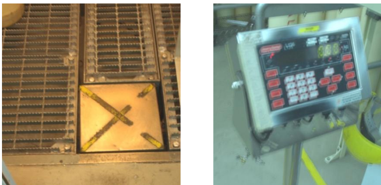
Figure 9 - Weigh scale platform and indicator

It is, therefore, impossible to determine the content of a cylinder containing a liquefied gas, except by weighing. A scale such as the one shown in Figure 9 makes this convenient. Cylinders containing liquefied gases are stamped or tagged with the tare weight to allow the content to be determined.