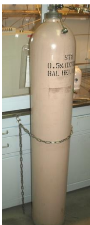
Figure 3 Cylinder holder

When the cylinder has reached its destination in the laboratory, it should be secured to a wall, a bench, or some other firm support, or placed in a cylinder stand or rack (Figures 3, 4 and 5). An ordinary chain or belt of the type commonly available from the gas supplier can be used. Once the cylinder has been secured, the cap may be removed, exposing the valve. The number of cylinders in a laboratory should be limited to minimize the fire and toxicity hazards.