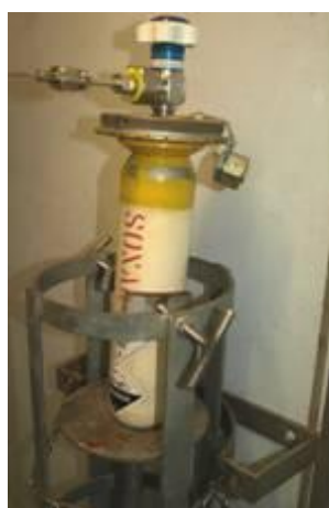
Figure 4 Small cylinder stand