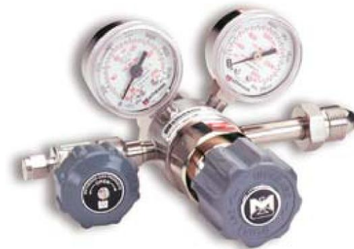
Figure 8 – Pressure regulator

It consists of a spring - (or gas-) loaded diaphragm that controls the throttling of an orifice. Delivery pressure will exactly balance the delivery pressure spring to give a relatively constant delivery pressure.