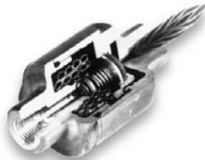
Figure 11 Flammable gas flash arrestor

Whenever a flammable gas is to be used it is recommended that a simple flash arrestor be installed in the line. Flashback is the reversing of the flame such that it travels through the line back into the pressure regulator or cylinder.