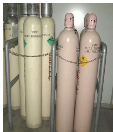
Figure 5 Rack cylinder storage