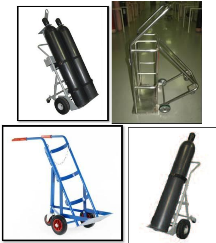
Figure 2 – Hand truck