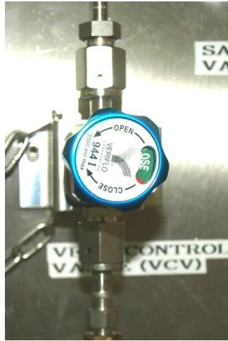
Figure 7 – Manual control valve

For non-liquefied gases, the most common device used to reduce pressure to a safe value for gas removal is a pressure regulator. This device is shown in Figure 8.