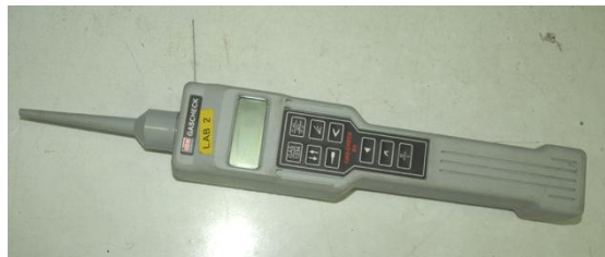
Figure 10 – Gas detector

There are numerous monitoring devices available for detection of dangerous concentrations of gases in the atmosphere (Figure 10). There are also appropriate chemical procedures for detecting leaks in lines and equipment and for determining dangerous concentrations of gases in the atmosphere. The user of gases should become familiar with suitable control procedures for the determination of such dangerous concentrations. Instructions are usually supplied in the Safety Data Sheets (SDS) associated with the particular gas being used.