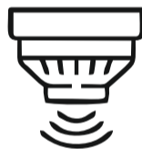
Gas Leak Detection