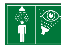
Emergency Eye Wash & Shower