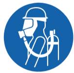
Self Contained Breathing Apparatus