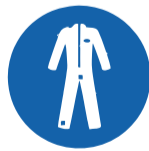
Chemical Protective Clothing