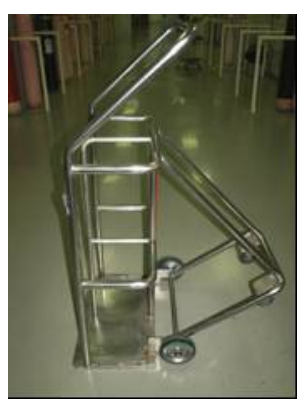
Figure 2 – Hand truck

Avoid dragging or sliding cylinders. Use hand trucks even for short distances.