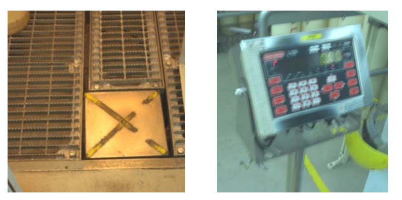
Figure 9 - Weigh scale platform and indicator

It is, therefore, impossible to determine the content of a cylinder containing a liquefied gas, except by weighing. A scale such as the one shown in Figure 9 makes this convenient. Cylinders containing liquefied gases are stamped or tagged with the tare weight in order to allow the content to be determined.