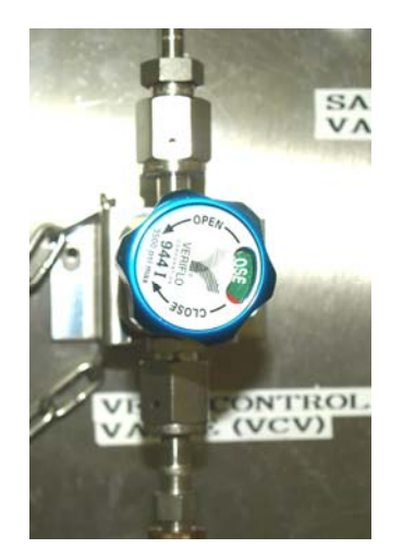
Figure 7 – Manual control valve

Rapid removal of the gas phase from a liquefied gas may cause the liquid to cool too rapidly, causing the pressure and flow to drop below the required level. In such cases, cylinders may be heated with temperature controlled to no higher than 125°F. Rapid gas removal can also be effected by transferring the liquid to a heat-exchanger, where the liquid is vaporized to a gas. This method imposes no temperature limitations on the material; however, care should be taken to prevent blockage of the gas line downstream of the heat-exchanger, as this may cause excessive pressure to build up in both the heat-exchanger and the cylinder. Safety relief devices should be installed in all liquid-transfer lines to relieve sudden, dangerous hydrostatic or vapour-pressure buildups.