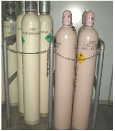
Figure 5 Rack cylinder storage