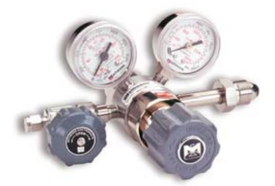
Figure 8 - Pressure regulator